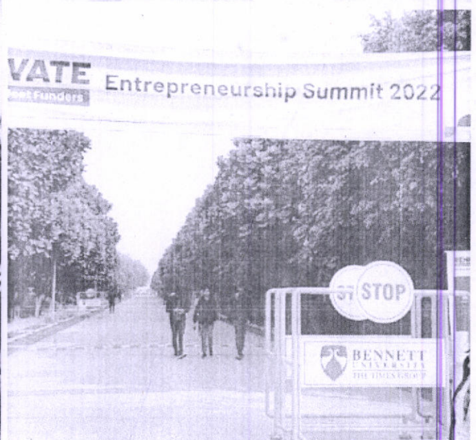
Collage of the students visit to BENNOVATE at Bennett University